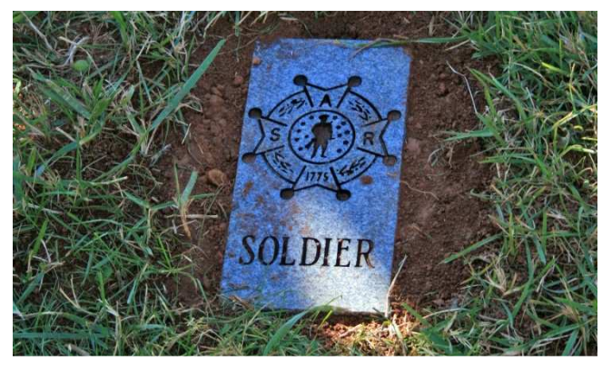
A simple SAR grave stone markes the site of Capt. Hawkins' burial.