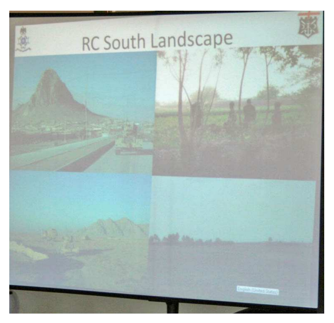
One of several charts used to describe the great diversity of landscape and environment faced by Army operations in Afghanistan