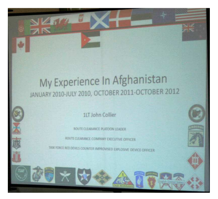
Chart showing title of talk, but also used to indicate wide variety of units supported by the route clearing operations of his and similar platoons

Because of the special insights brought by Lt. Collier to the militarily knowledgeable audience, there were many questions answered after his talk.