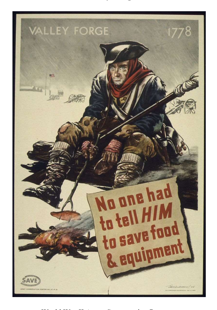
World War II Army Conservation Poster

Valley Forge, 1777-1778. Diary of Surgeon Albigence Waldo, of the Connecticut Line.