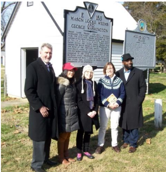
Left: A group of history enthusiasts at the “George Washington and the Cherry Tree” Historical Marker Dedication.