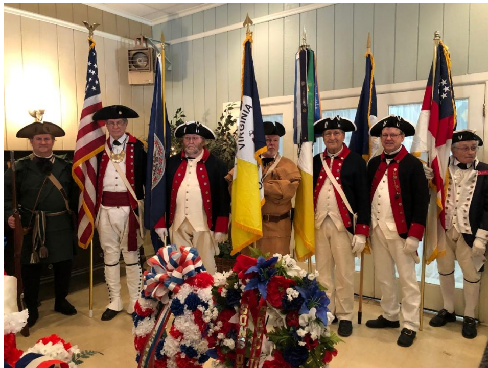
VASSAR Color Guard at the celebration of the Leedstown Resolutions.

The ceremony was followed by a catered lunch and a time of fellowship.