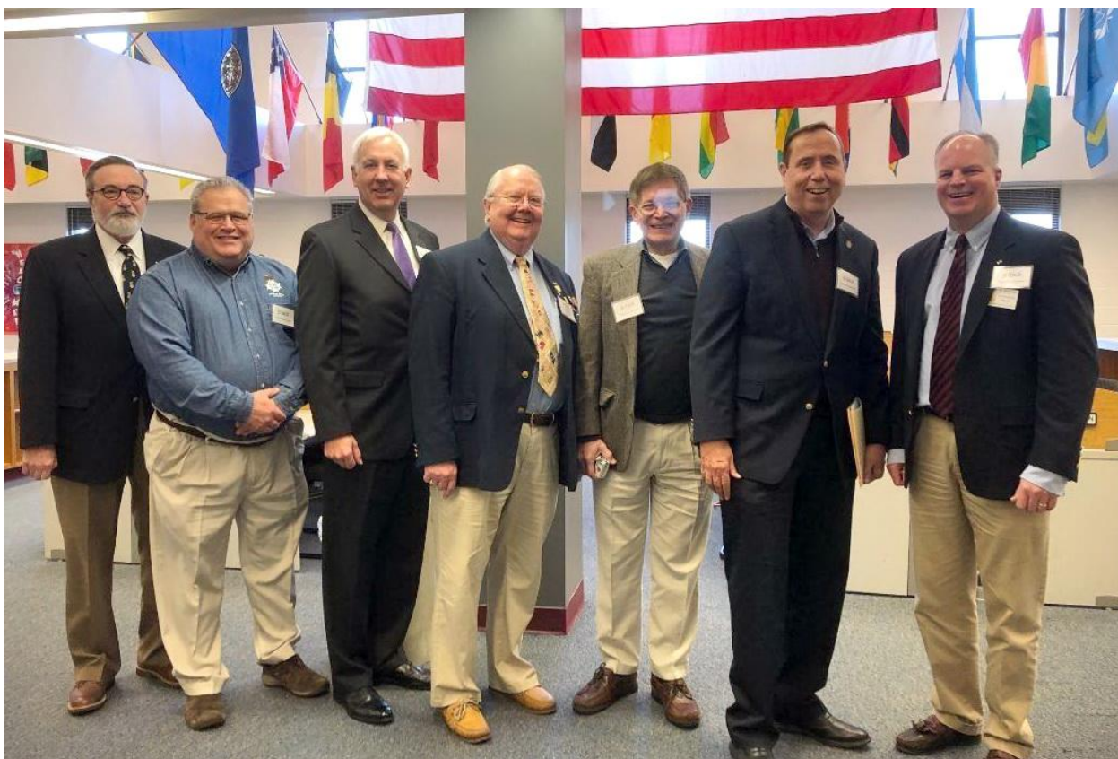
History judges from various local chapters of the Sons of the American Revolution.