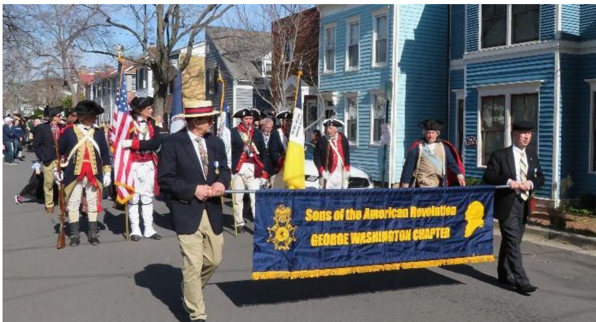
SAR. unit at the start of the parade, with VASSAR Color Guard leading off behind the banner.

All members of the Colonel William Grayson chapter should put this annual parade on their calendars since it always occurs on the official holiday and is a local event for all of us living in the Washington DC area. A uniform, while encouraged, is not a requirement for marching in the parade, so all come next year.