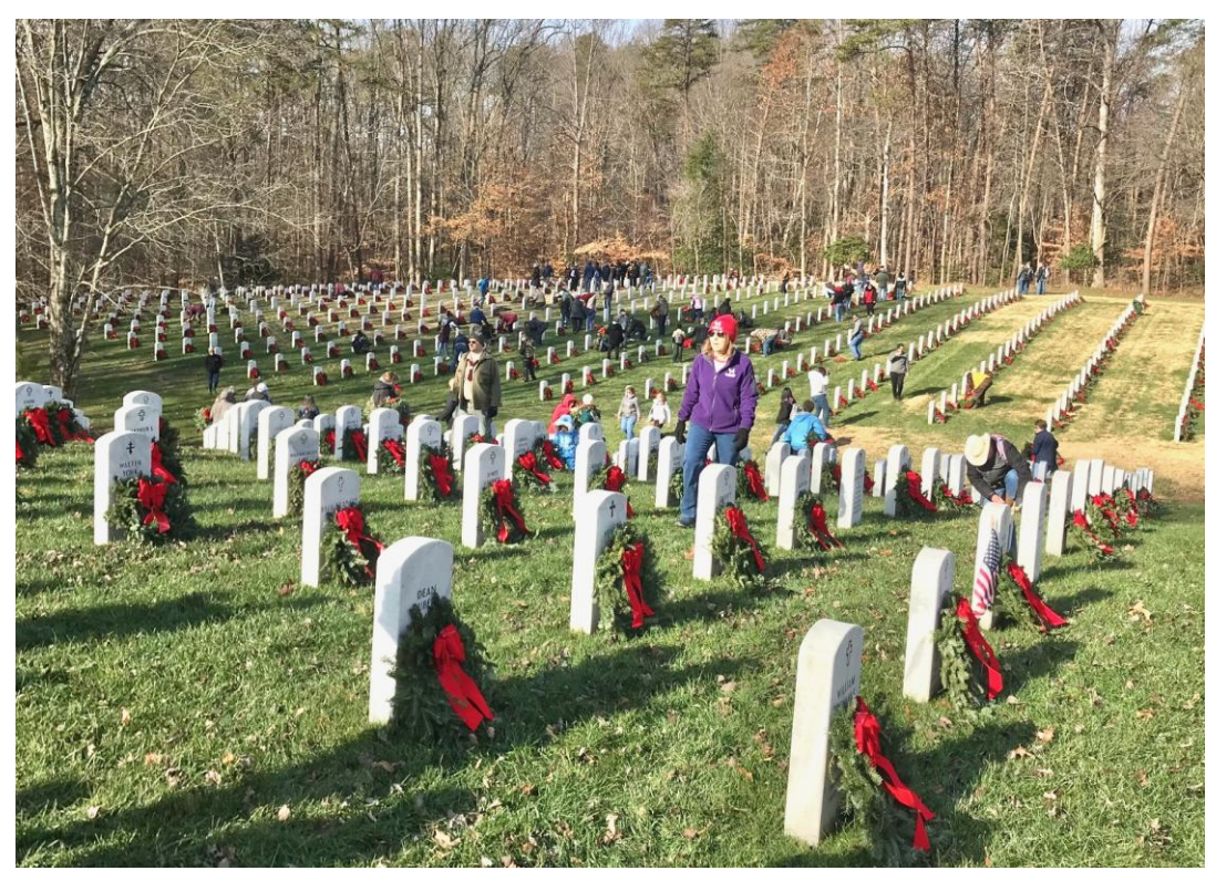
Participants finish the placement of wreaths in one section of the Cemetery.

For more information about the Sergeant Mac Foundation, check out their website at https://www.sgtmac.org