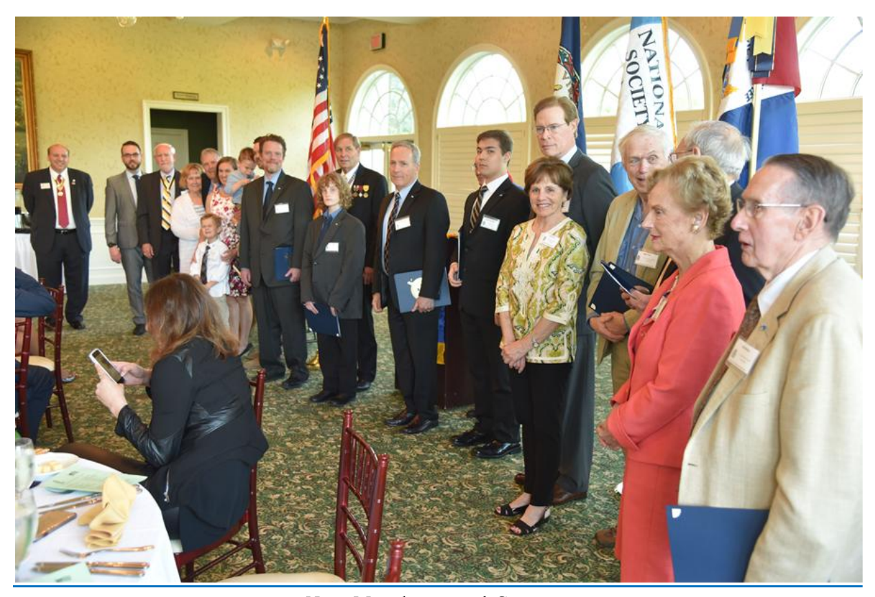
New Members and Guests.

The CWG Chapter started with twenty-five members in 2007; Chapter membership has grown to 191 members with membership continuing rapid growth. Members have become active in the community and participate in a great many patriotic events throughout Virginia and adjoining states.