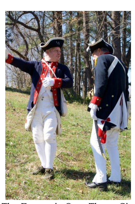
The Enemy is Over There, Sir.