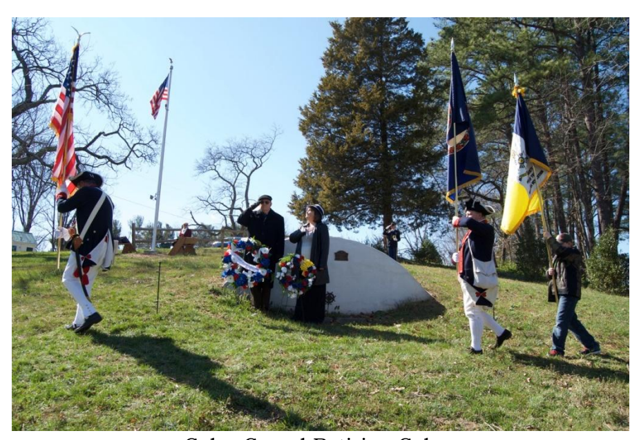
Color Guard Retiring Colors.